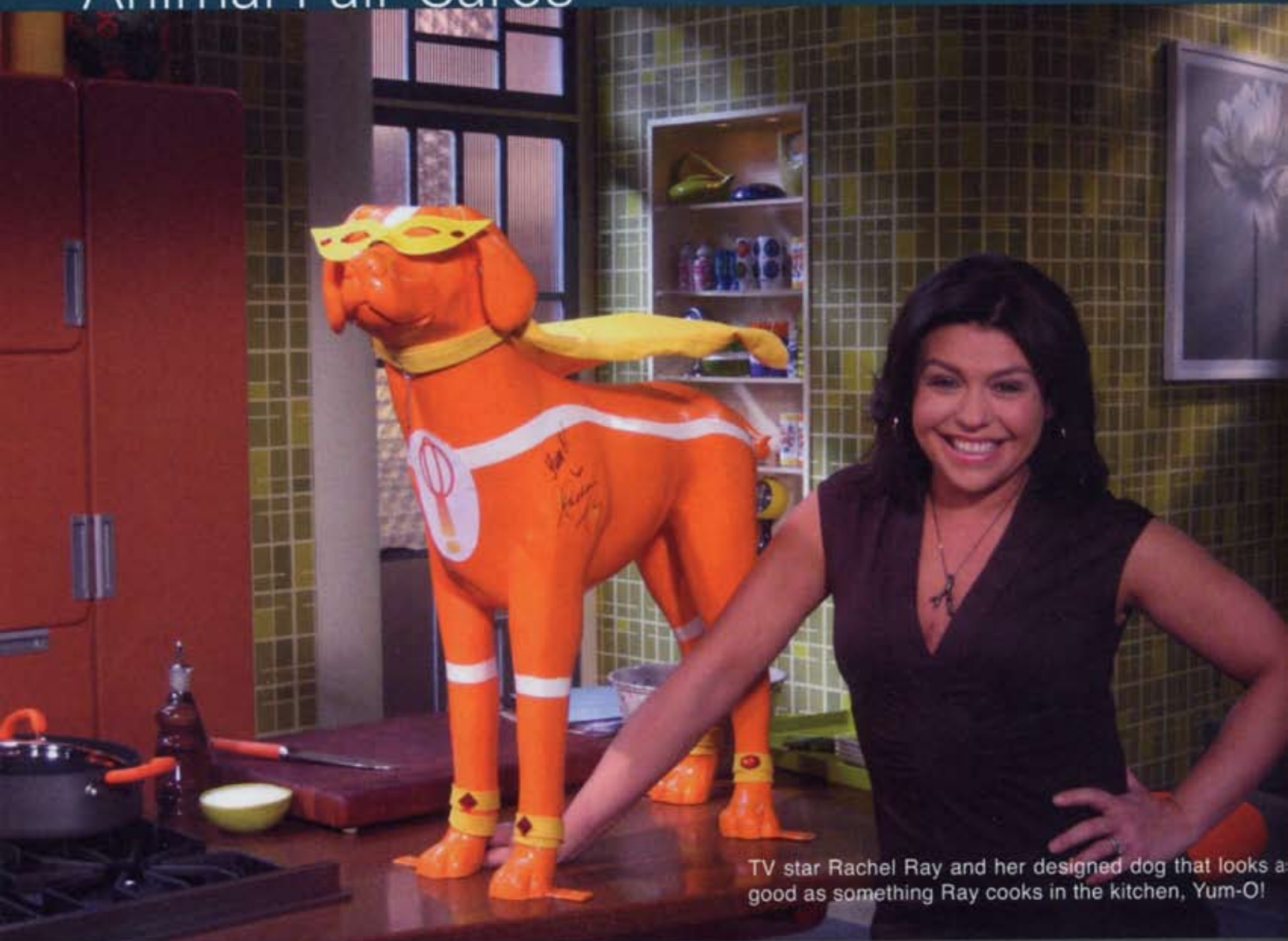
TV star Rachel Ray and her designed dog that looks as good as something Ray cooks in the kitchen, Yum-O!