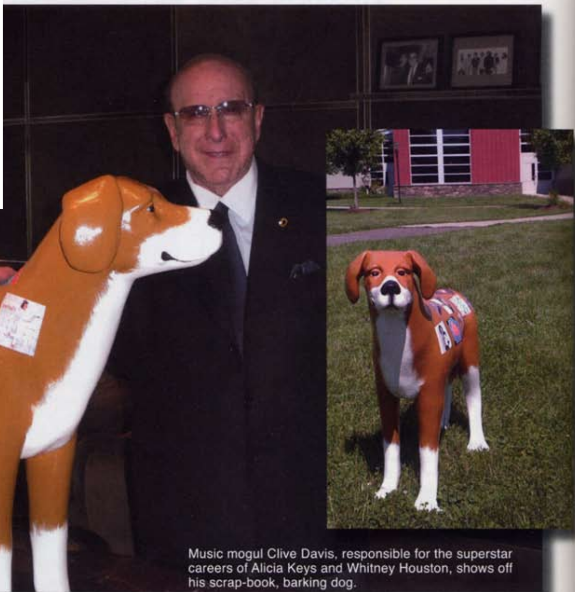
Music mogul Clive Davis, responsible for the superstar careers of Alicia Keys and Whitney Houston, shows off his scrap-book, barking dog.

Many may remember back in 1999 when over 300 life size art exhibition cows took over Chicago. While it did seem somewhat unusual for an urban metropolis to be congested with so many rural farm animals, the truth is that the cows were merely sculptures, decorated by local artists, photographers, designers, architects and celebrities. The city-wide cow décor, now known as CowParade, was so popular it expanded and migrated to all six continents raising millions of dollars for charity.