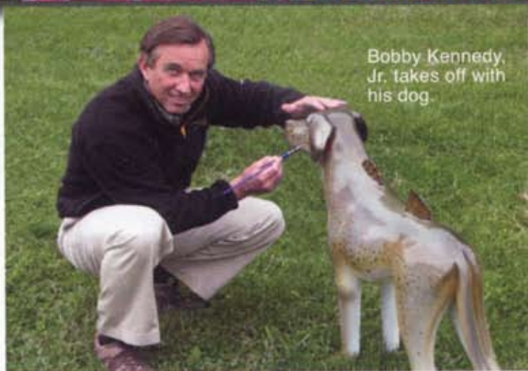
Bobby Kennedy, Jr. takes off with his dog.